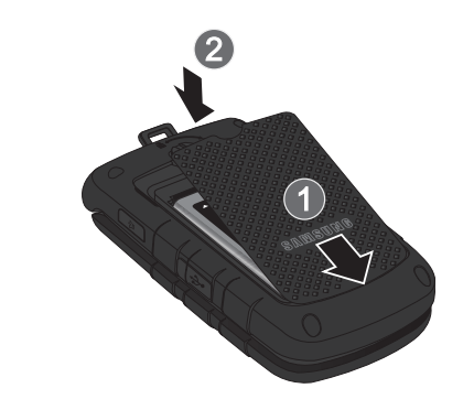
Note: The battery must be properly installed before charging the battery or switching on the phone.

Important!: When placing the cover back on the phone, press down firmly along the edges to ensure that the cover is flush with the phone. This will ensure that the battery compartment is pressurized and that the phone is waterproof.