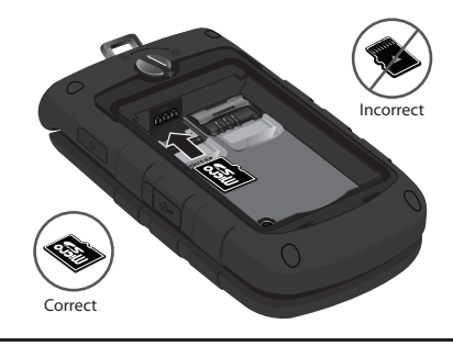
Warning!: Please note the printed circuit side faces down when inserting the card.